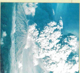
▲ Figure 5-18 Mount St. Helens erupted in 1980.

Thinking Critically Why is it important to predict volcanic eruptions?