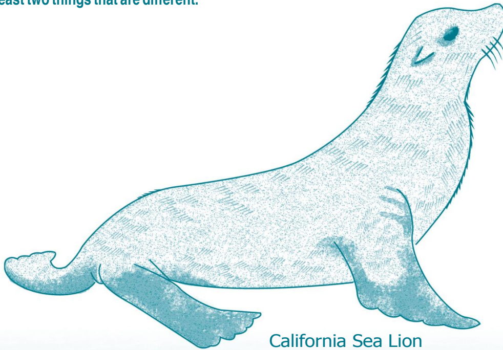
California Sea Lion

Find at least two things that are different.